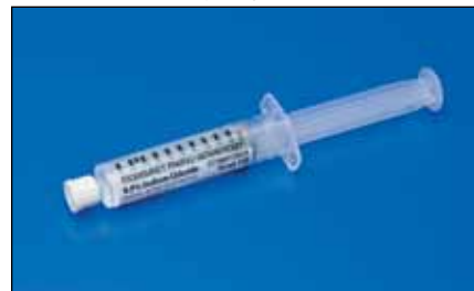
MONOJECT PreFill™ (Covidien, Sharps Safety Division)

All prefilled flush syringes are single-use devices and do not contain a preservative agent. This means that they should be attached to a catheter hub only once, used, and then discarded. In an attempt to save time and money, some nurses may think it is appropriate to use 5 mL of the saline in a prefilled 10-mL syringe to flush a catheter